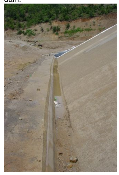
Floxation of waterproofing system Pur (Secrete prone Parous concrete Dan Body

As this fixation has to be watertight the concrete had to be prepared with mortar to guarantee a smooth surface for the fixation. A vertical concrete structure should avoid the passage of water under the earth dam.