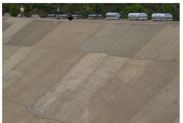
Porous concrete as support of the Waterproofing system

The body of the dam was built up in compacted layers of earth. The subgrade for the waterproofing was realised with a porous concrete. This porous concrete represents a perfect underground for the waterproofing system and also works as drainage layer under it.