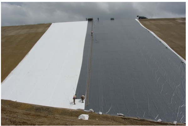
Application of 1st geotextile and ALKORPLAN 35053

The seaming of the geomembrane was executed by a welding automate creating a proofable double welding. Each welding was tested following international prescriptions for welding.