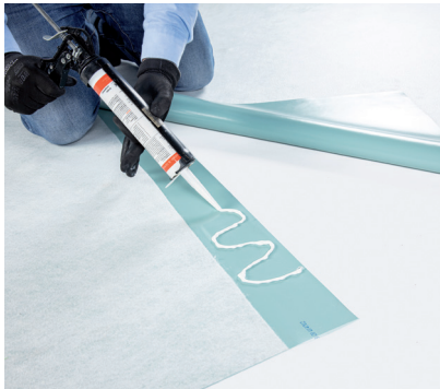
Sealing by mastic glue RENOLIT CEM 805.

In post-applied installation, the geomembrane will be placed with the PP fleece facing the hardened concrete and fixed with nails at the edges. The RENOLIT ALKORPLAN Pro CS geomembranes can be sealed together very easily by mastic glue RENOLIT CEM805, by thermal welding or by using butyl tape RENOLIT ALKORPLAN Pro BAND. The backfilling will be sized to exert a minimum pressure of 150 kg/m 2 on the geomembrane.