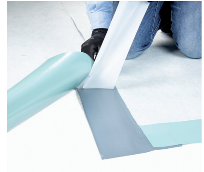
Sealing by butyl tape RENOLIT ALKORPLAN Pro BAND .

These data are statistic figures according to Harmonized European Standards. This document cancels and replaces any other document previously published. In order to improve his products, the manufacturer reserves the right to change them without prior notice.